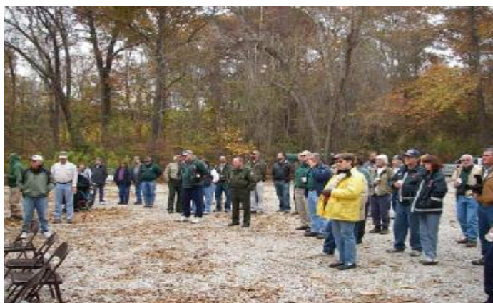
A very nice crowd for the dedication on a chilly Tuesday morning