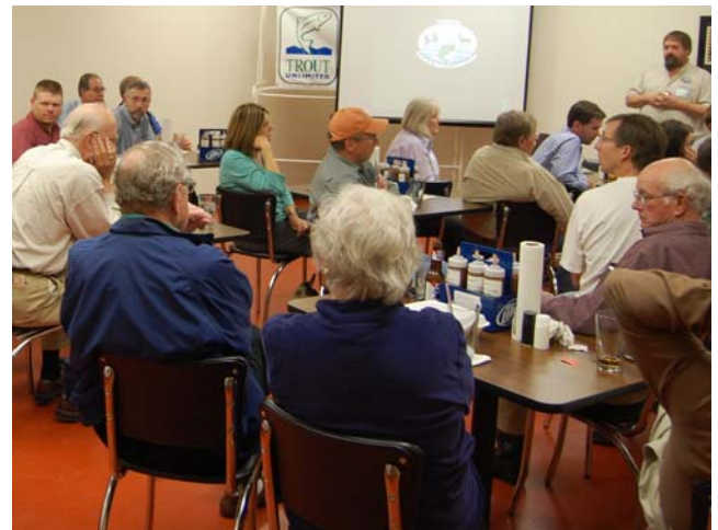
Deep discussion with Game & Fish experts.