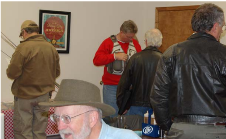
Doing our part to help sporting goods retailers everywhere!