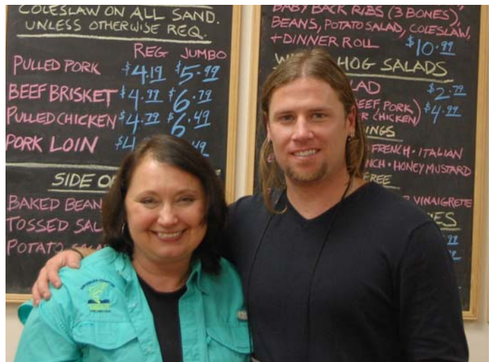
"What should we order?"