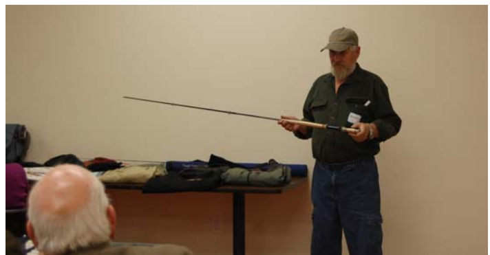
"If I let you hold it, I might not get it back."