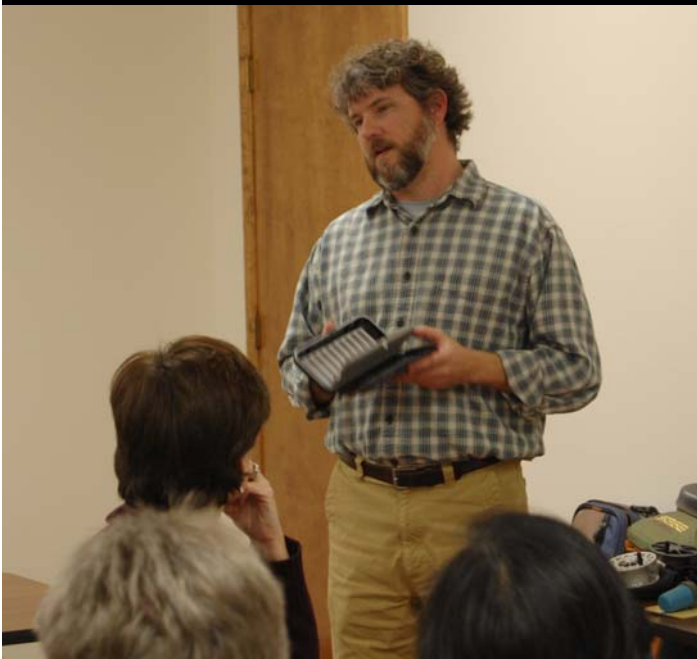
"If I only had some flies."