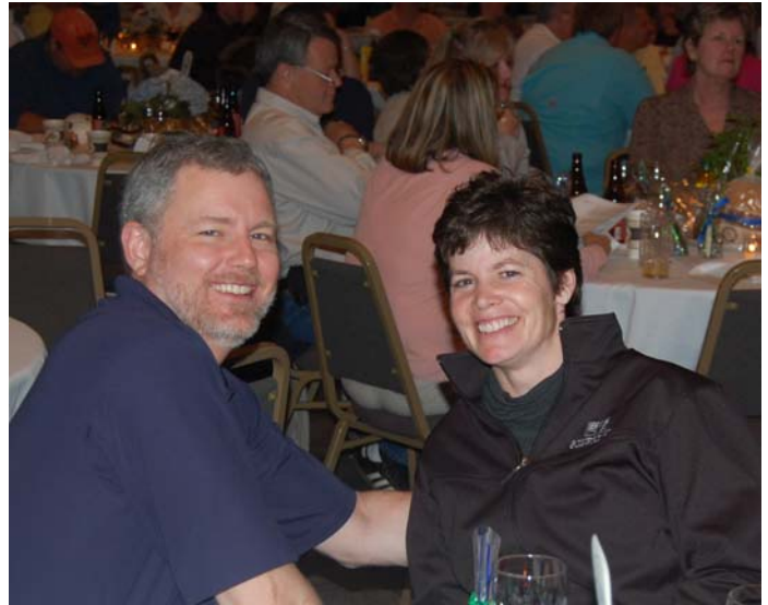
A great time and a great turnout.