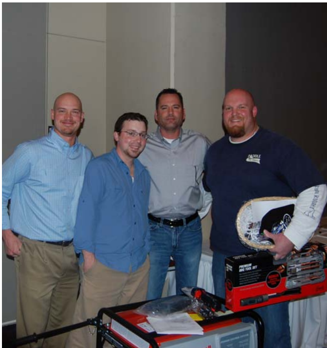
Winners of the Grill and the Generator.

300 North College, Suite 224 Fayetteville, AR 72701